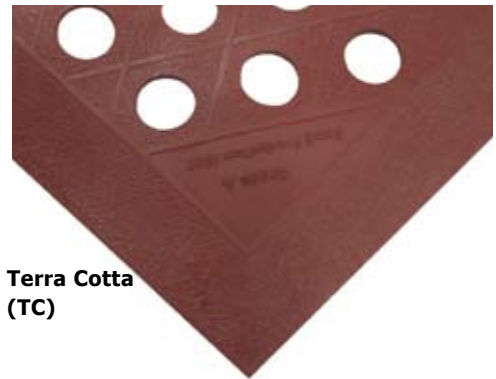
Terra Cotta (TC)