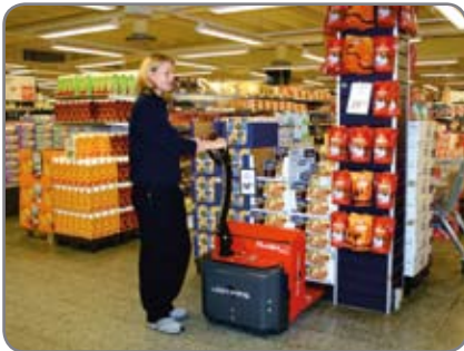
Panther Mini (capacity 3100 lbs.) is perfect for easy pallet transport, e.g. in super markets and in stock areas.