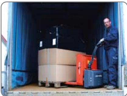
Panther Maxi (capacity 4000 lbs.) is perfect for heavy pallet transport, e.g. in the transport industry.