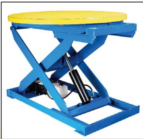
Shown with optional integral turntable top

The Lift2K & Lift25K Scissor Lift Tables are the best value 2000 & 2500 lbs. capacity lifts on the market today. They are designed to increase productivity and reduce worker strain in today's harsh industrial environments. By lifting and accurately positioning the load, the Lift-2K and Lift-25K lift tables eliminate excess lifting and stretching that ultimately leads to worker fatigue injuries and possible product damage. No matter how you compare it, the Lift-2K and Lift-25K lift more for less.