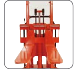
Adjustable forks are available as optional extra in many different lengths and types.

Available with manual and electric lifting.