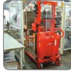
High maneuverability: Short overall length, large turning angle, assisted steering and low own weight.