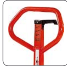
Ergonomic handle ensures the user a relaxed hold. The handle can be marked with the name/department.

Strong construction ensures a long operating life and low maintenance costs.