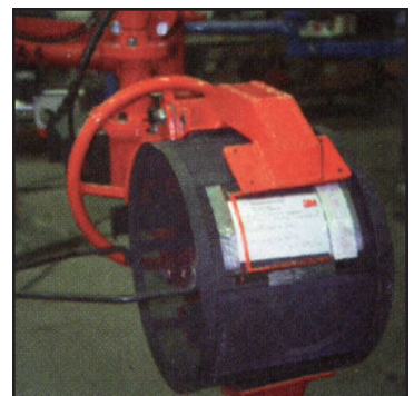
Tool grips and manually rotates a handling basket used for plating 250 pound parts

Positech ™ A Division of American Handling Systems, Inc. Corporation