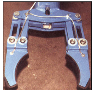
Special gripper handles solid fuel rockets during test and assembly for defense project.