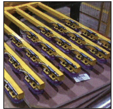
Tool allows for the automated transfer of tables and desktops with specially designed vacuum tool that allows product to be placed on a conveyor.

Options available for extended lift and reach