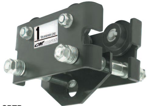
CBTP (Plain Trolley) 1/4 To 5 Ton