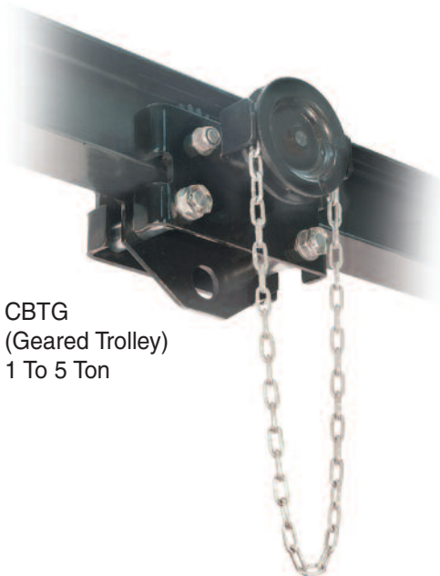
CBTG (Geared Trolley) 1 To 5 Ton