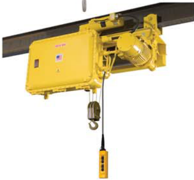
WIRE ROPE HOIST