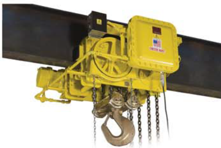
SLE ELECTRIC LOW HEADROOM CHAIN HOIST