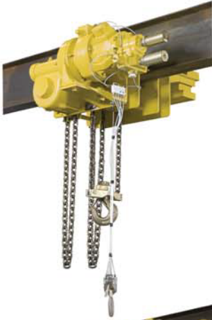
MODEL SLA AIR HOIST

CHESTER HOIST offers a combination of premium quality specialty products and application engineering capabilities developed over many years serving the needs of the oil and gas industries. These products and capabilities make us uniquely qualified to handle your most difficult hoisting applications and to provide HOISTING SOLUTIONS .