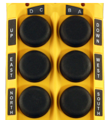
Labels Located Next To Buttons for Easy Visibility and Durability