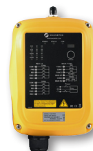
Flex EX 4/6 Receiver

Flex EX2 receivers were designed with field installation and serviceability in mind. Receivers come prewired with 6' of cable and mounting hardware allowing fast installation. Onboard diagnostic and output LEDs provide useful system status information when installing and troubleshooting. All components are easily accessible and field replaceable.