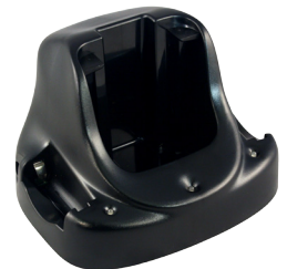
Charging Cradle Available for Easy Recharge