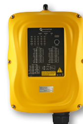
Flex EX 8/12 Receiver

For more information, contact your local Magnetek Sales Representative, radio.sales@magnetek.com , or the Magnetek location nearest you.