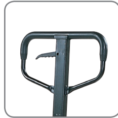
Rubber covered handle ensures a comfortable hold.