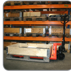
The BF 2500 pallet truck shown being used in the component industry moving heavy goods.