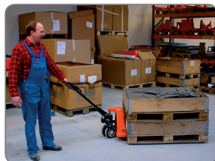
The BF 2500 pallet truck transports components between work stations in the component industry.