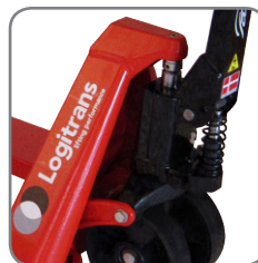
Permanent quick lift.