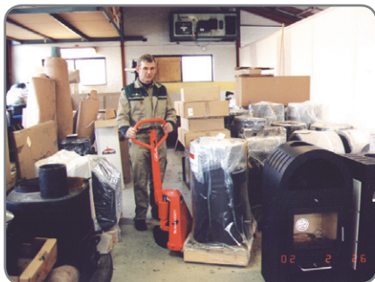
An easy handling of goods is ensured even in very confined spaces.