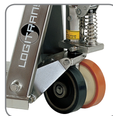
Different wheel types, to suit the needs of the user.