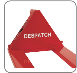
The company name or logo can be cut out in the triangle of the Panther.