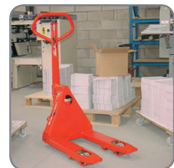
Panther is available with different fork lengths.