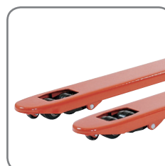
Available with single or tandem fork wheels.