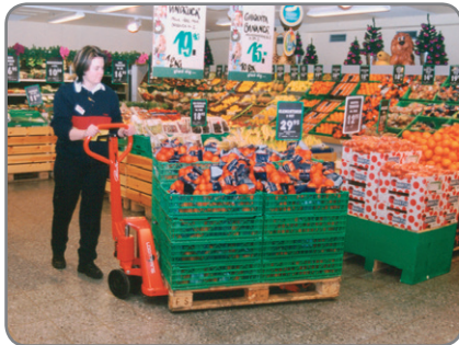
Adjustable fork height - no problems when handling low and worn pallets.

Stainless and explosion proof pallet trucks are also available.