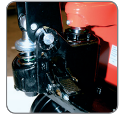
Reliable leak-proof hydraulic system.