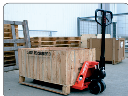
The BF 2500 pallet truck moves material in the packaging industry.