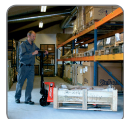
The BF 2500 ensures an optimum utilization of space in storage areas.