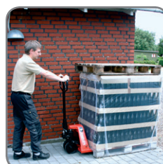
The BF 2500 shown being used moving a pallet of beer bottles.