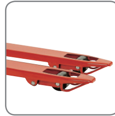
The hoop skates on the forks ensure an easy fork insertion and withdrawal in/out of pallets.