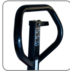
Ergonomic handle ensures the user a relaxed hold. Can be marked with name/department.