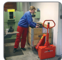
Patented cylinder construction gives low overall height.