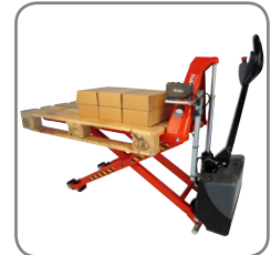
Level control (optional extra) ensures a constant working height.