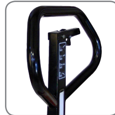
Ergonomic handle ensures the user a relaxed hold.