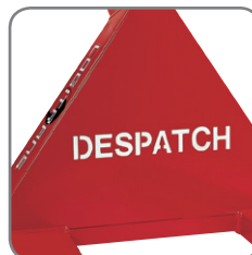
Can be marked with name/department.