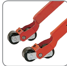
The tandem wheels have a brake effect and are not hostile to the floor.