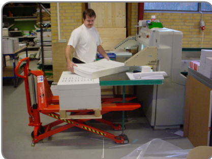
The manual Thork-Lift needs very low power for the pump function and has foot protection and neutral position.