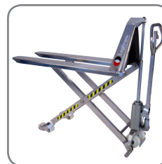
Available as manual, electric and stainless.