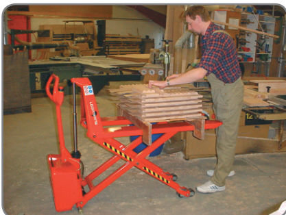
Optional extras: remote control, level control and brake.