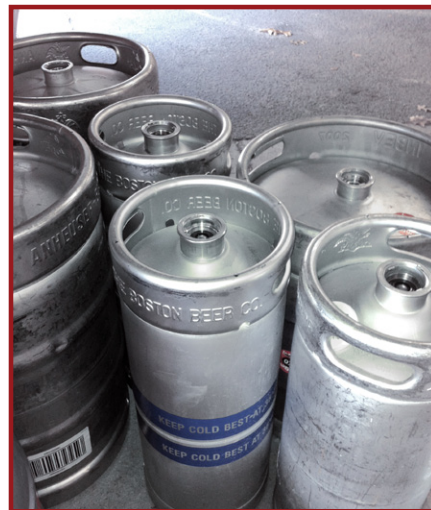
Works with a wide variety of keg sizes and styles