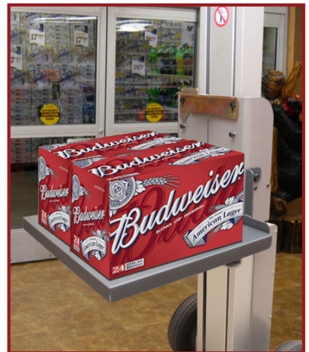
An optional shelf is available for handling cases