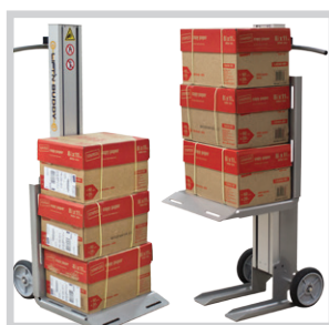
Base legs allow unit to stand even when raised under load.

Use LNB-2 to transfer loads to shelves, workbenches, conveyors, processing equipment, delivery trucks, and customer vehicles in a wide range of facilities including manufacturing, warehousing, retail, office, medical, hospitality, commercial bakeries, repair/rental shops & more!