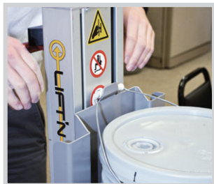
Pail retainer keeps loads secure.