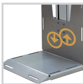
Large 20" x 16" platform with load backrest and angled lip.