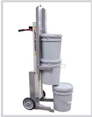
Safely handle 3 pails at a time.