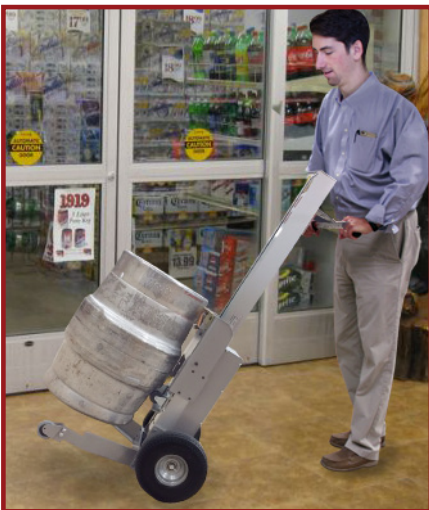
Small and highly maneuverable, it even works in cramped walk-ins