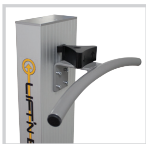
Ergonomic handle with lifting and lowering thumb switch.