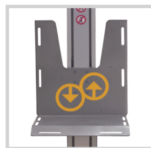
Platform slots for securing loads with bungees or straps.