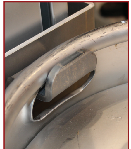
Lifting bracket holds kegs securely in place during transport and lifting