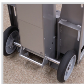
Kick axle for easy tilting of LNB-2 for load transport.