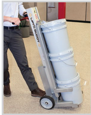
Tilts back for easy transport.