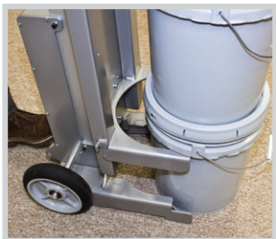
Lifting yoke holds pails in place.