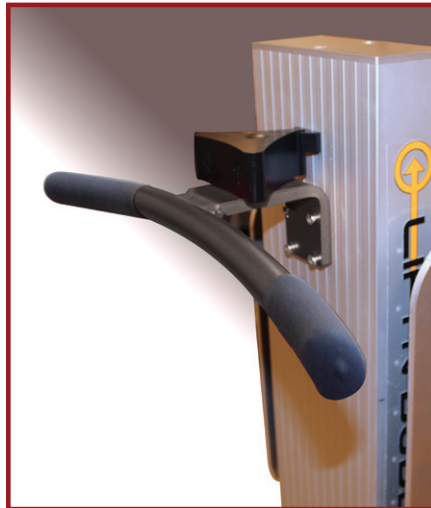
Ergonomic handle with easy access lift and lowering controls