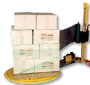
PalletPal Semi-Automatic Stretch Wrapper