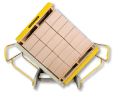
PalletPal Pallet Rotator/Inverter

SOUTHWORTH making work faster, safer, and easier