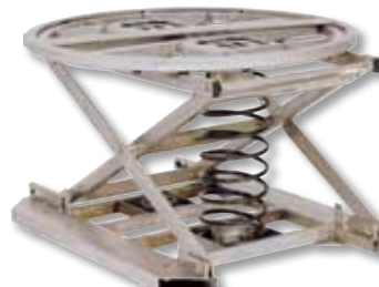
PalletPal Stainless Steel