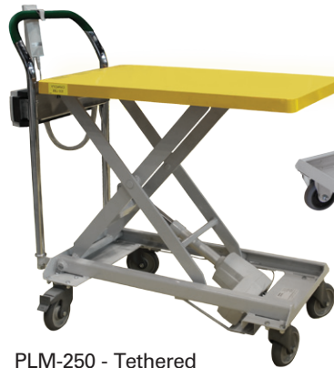
PLM-250 - Tethered Remote Control Standard