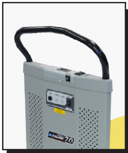
Ergonomic comfort shape handle