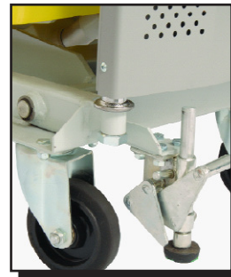
Smooth rolling casters and floor lock