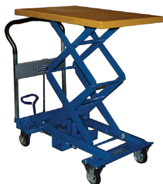
Medium Duty/High Lift Dandy A-350W