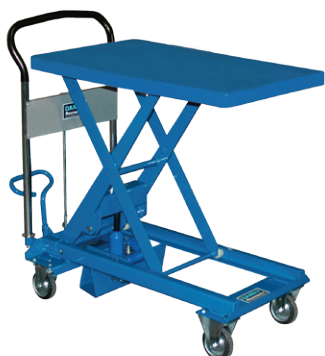
Light Duty - Dandy L-150