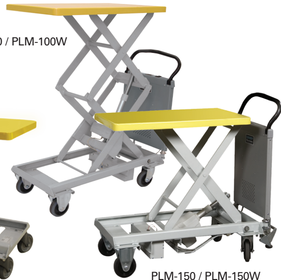
PLM-150 / PLM-150W