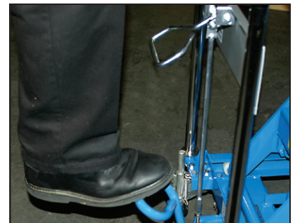
180° Access Foot Pedal

Can be pumped from the back or side of the unit. Generous size ensures solid contact with foot pedal regardless of footwear.