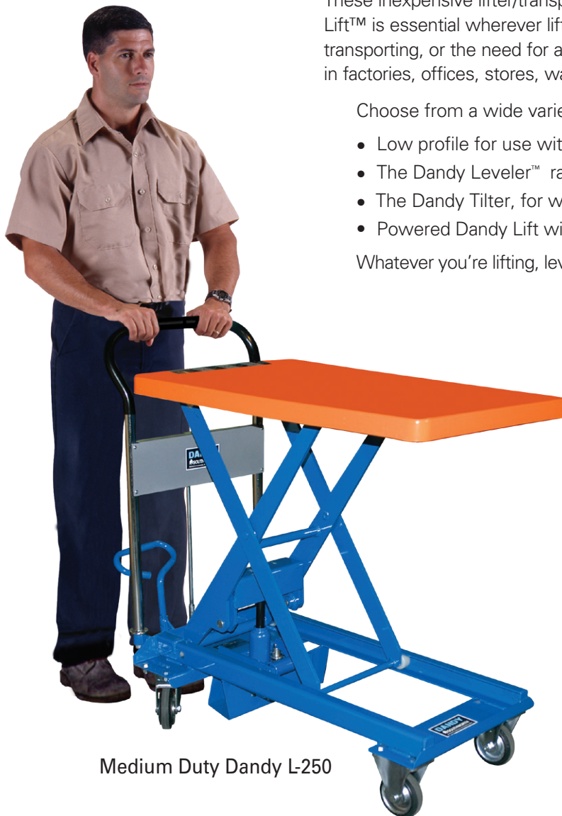
Medium Duty Dandy L-250

Whatever you're lifting, leveling or transporting, there is a Dandy Lift to suit your needs.