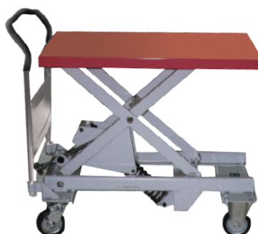
Auto Leveling - Dandy Leveler Dandy DLV-150 / Dandy DLV-500