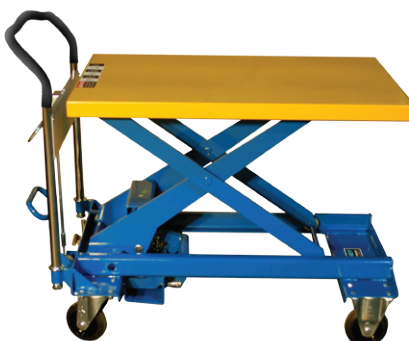
Medium Duty - Dandy A-500