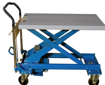
Heavy Duty - Dandy A-800