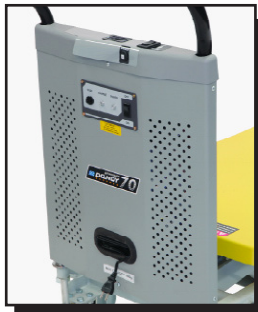
Full shielding of all electrical components