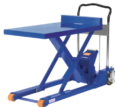
Pallet/Skid Lifter Transporter Dandy M-500L