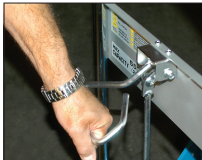
Qwik-Grip Lowering Handle

Open design, oversized lowering handle can be accessed from any position behind or beside the unit. Simply lift handle to lower loads.