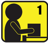
Reach Factor 1 Minimal Reach-Over