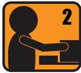
Reach Factor 2 Some Reach-Over