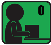
Reach Factor 0 No Reach-Over

The products in this brochure provide workers with improved access to palletized goods. Check the Reach Factor Icon associated with each product to determine the level of access it provides.